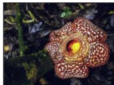
Picture of a Rafflesia

What wild kind of flowers can you come up with? Find out by inventing a flower. Gather parts of different flowers and plants: leaves, stems, flowers, seeds, etc. Or, cut out plant and flower parts from pictures in old magazines. Glue parts together on a piece of cardboard or poster board to make crazy new flowers.