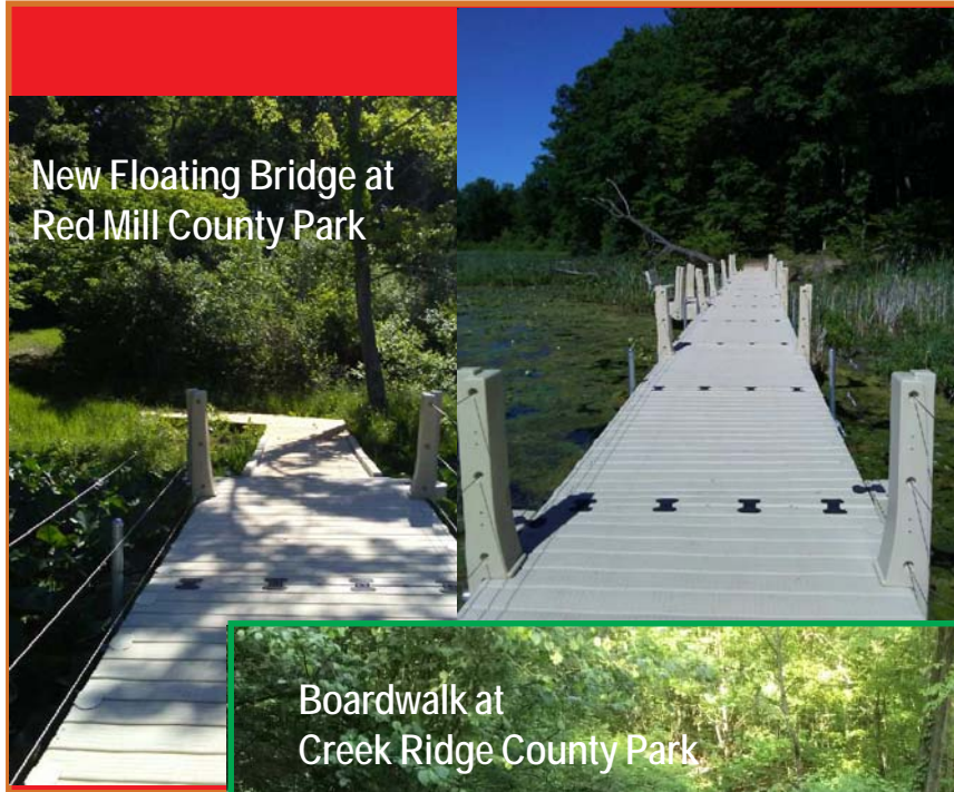
New Floating Bridge at Red Mill County Park