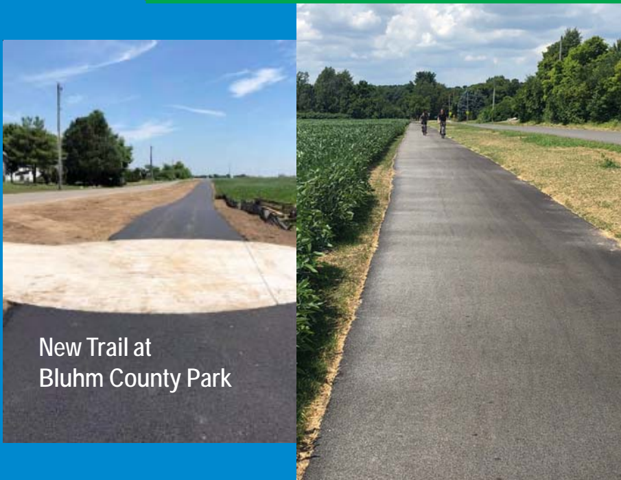
New Trail at Bluhm County Park