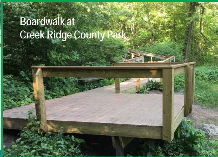
Boardwalk at Creek Ridge County Park