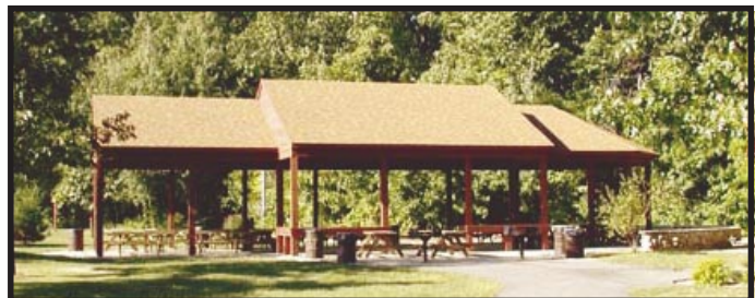
The Novak shelter at Creek Ridge is just one of Rogers many remarkable accomplishments.